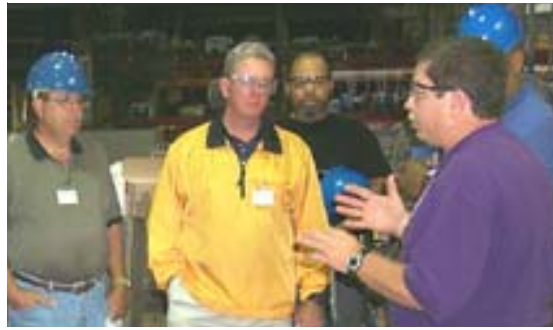
OSHA staff from Regions IV and VI toured the Dow Chemical Company's Louisiana Operations Facility in Plaquemine as part of the PSM seminar presented by Dow October 13-14, 2004.

The Alliance, signed on January 13, 2003, and renewed on May 26, 2004, published a case study on ergonomics, hosted a process safety management (PSM) workshop, and helped to develop an eTool on Ammonia Refrigeration. In addition, the Alliance continues to work on