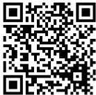
OSHA Standard No. 1926.651 Excavation Manual